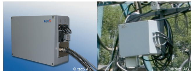
AgroSpec® spectrometer system

Evaluation and analysis of the spectra is often carried out by the predictions based on chemometric models.