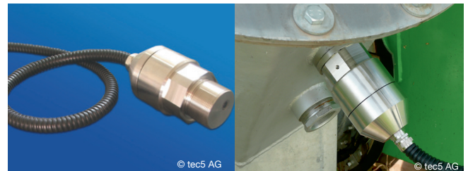
NIRON measuring head