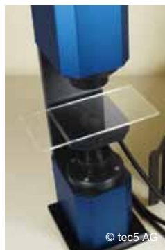
Measuring Head RTP