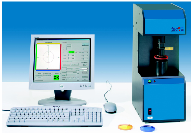
LensColour Analyser TFM-1

The system was developed in cooperation with Rodenstock GmbH, Munich, Germany.