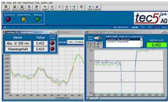
MultiSpec Pro spectroscopy software