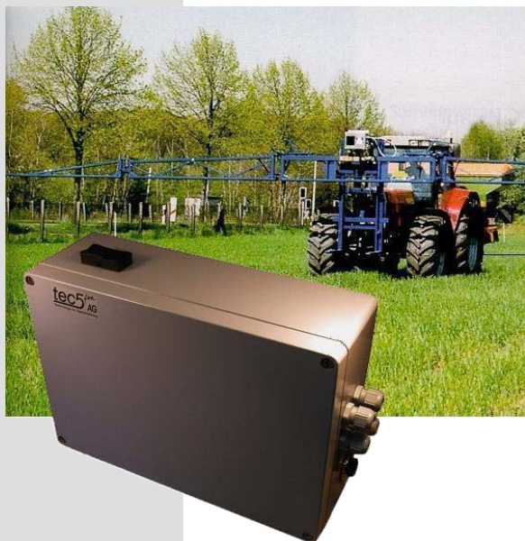
Fig.1: tec5 AgroSpec