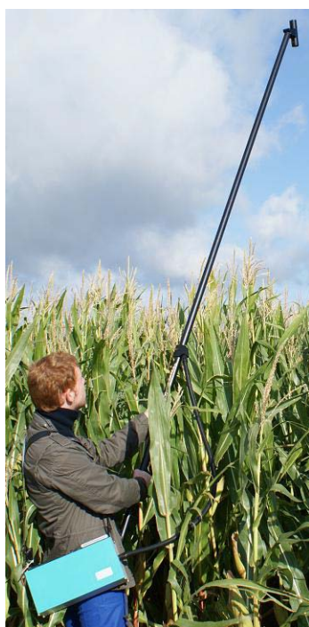
Fig. 2: In-situ measurements of maize

tec5 spectrometer systems have been used for years now in well-known research establishments in the agricultural field and also in the well-known Yara N-Sensor. Because of their high performance they prosper in this demanding area.